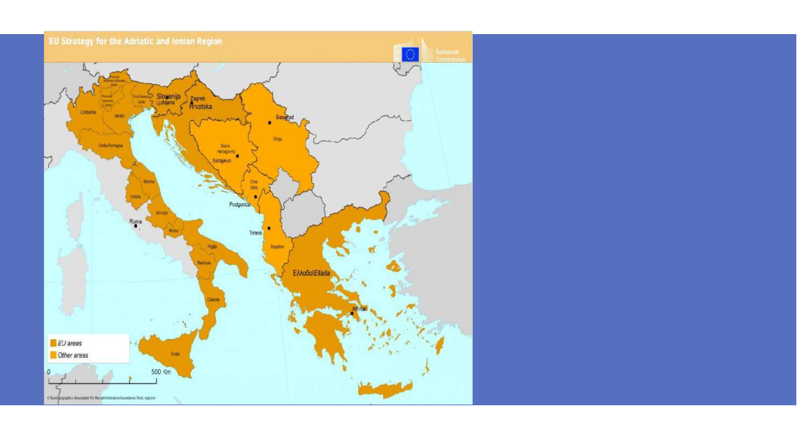
Ravenna, 5 maggio 2015